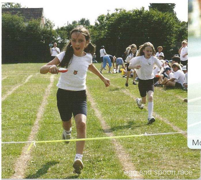
egg and spoon race